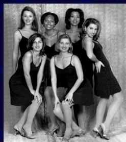
The Liberty Misses

times to over 15 countries performing for our Servicewomen and Servicemen. While at home, we performed for the Veterans and Veteran's organizations along the east coast.